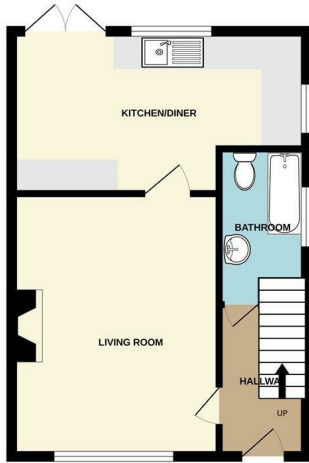
GROUND FLOOR 382 sq.ft. (35.5 sq.m.) approx.